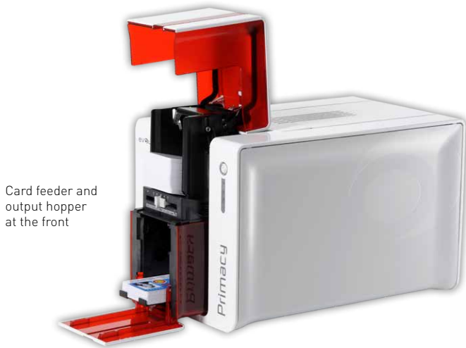
Card feeder and output hopper at the front