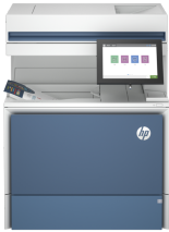
HP Color LaserJet Enterprise MFP 6800dn Printer

This printer is intended to work only with cartridges that have a new or reused HP chip, and it uses dynamic security measures to block cartridges using a non-HP chip. Periodic firmware updates will maintain the effectiveness of these measures and block cartridges that previously worked. A reused HP chip enables the use of reused, remanufactured, and refilled cartridges. More at: http://www.hp.com/learn/ds