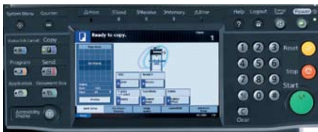
8.5 inch colour touch panel with on-screen guidance.

With the potential to do so much at once, you might think it's easy to lose track of what you're doing. That's unlikely with a colour touch panel this large. To increase usability, the buttons and icons that people use most often are given priority. Related menu options are intuitively shown on the same screen. And it's easy to retrieve files stored in the 80 GB document box, without opening files, by simply viewing colour thumbnails and previews.