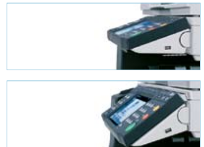
Find the perfect viewing angle with the adjustable control panel.